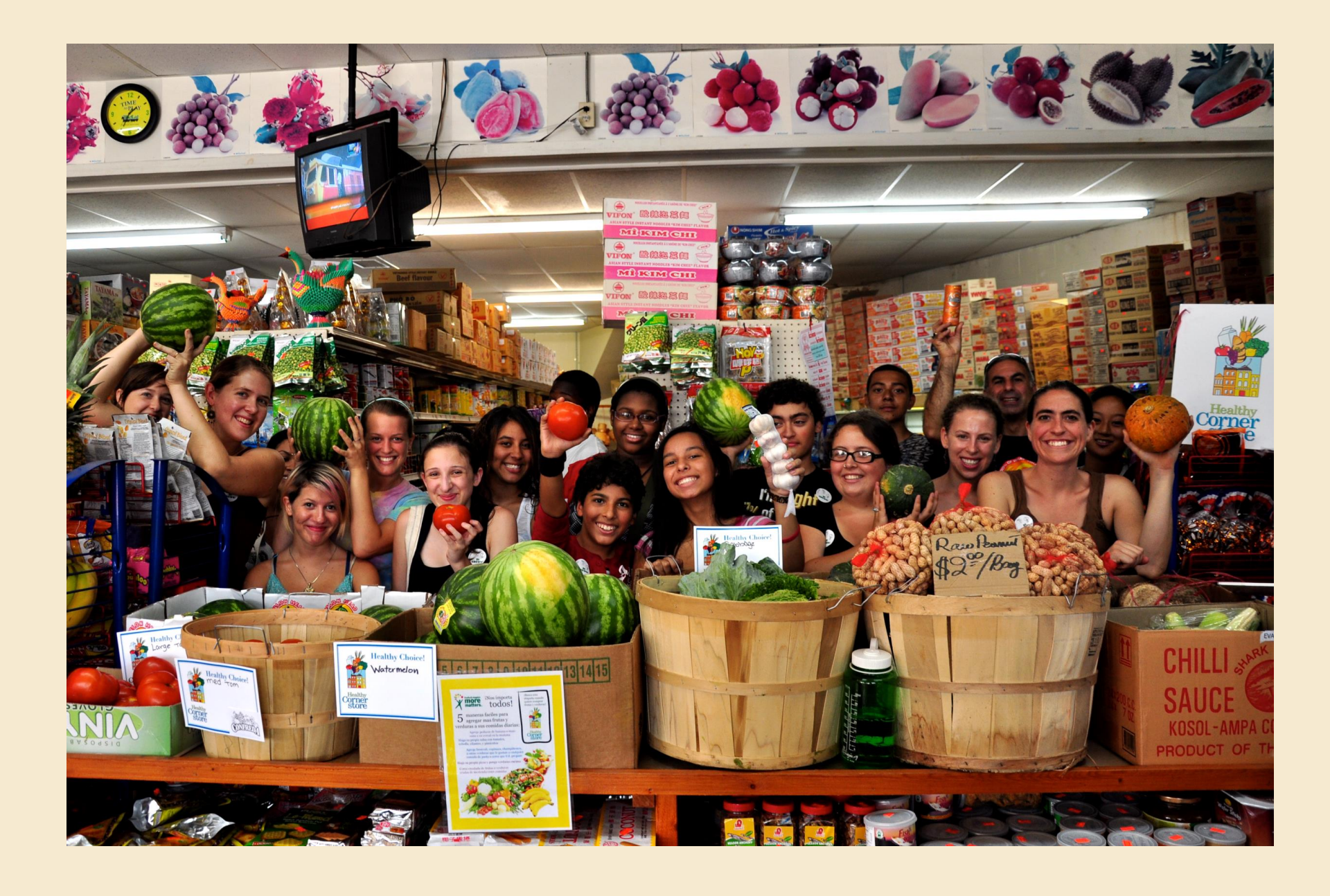
A Healthy Corner Store opening