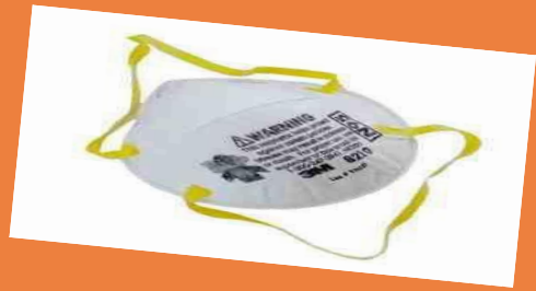
N95 Disposable Air Purifying Respirator