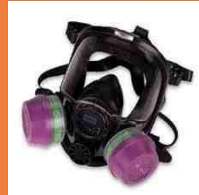
Full Face Air Purifying Respirator