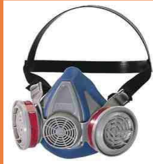
Half Face Air Purifying Respirator